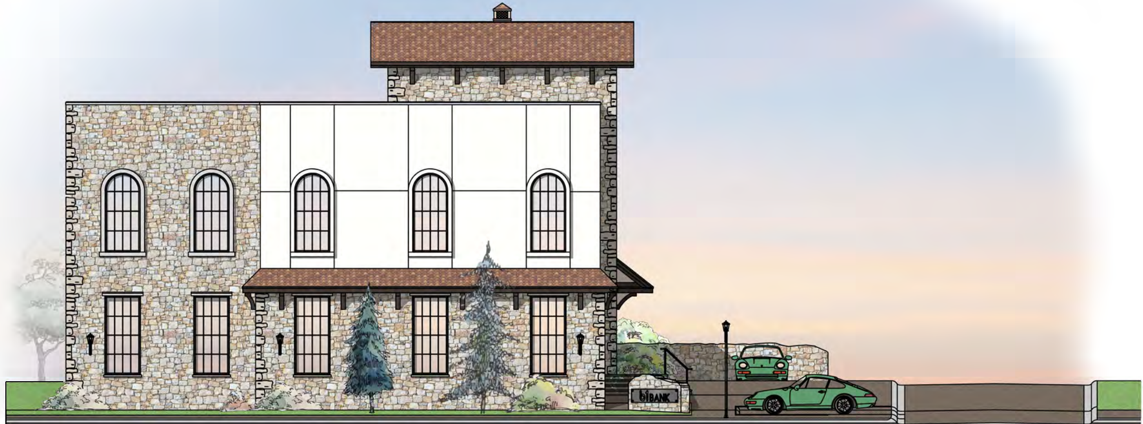
1 SIDE ELEVATION - SOUTH - ANDORRA DRIVE SCALE: 3/32" = 1'-0"

REFER TO ENTRADA DESIGN GUIDELINES (ORDINANCE 760) FOR DETAILED DESIGN INFORMATION