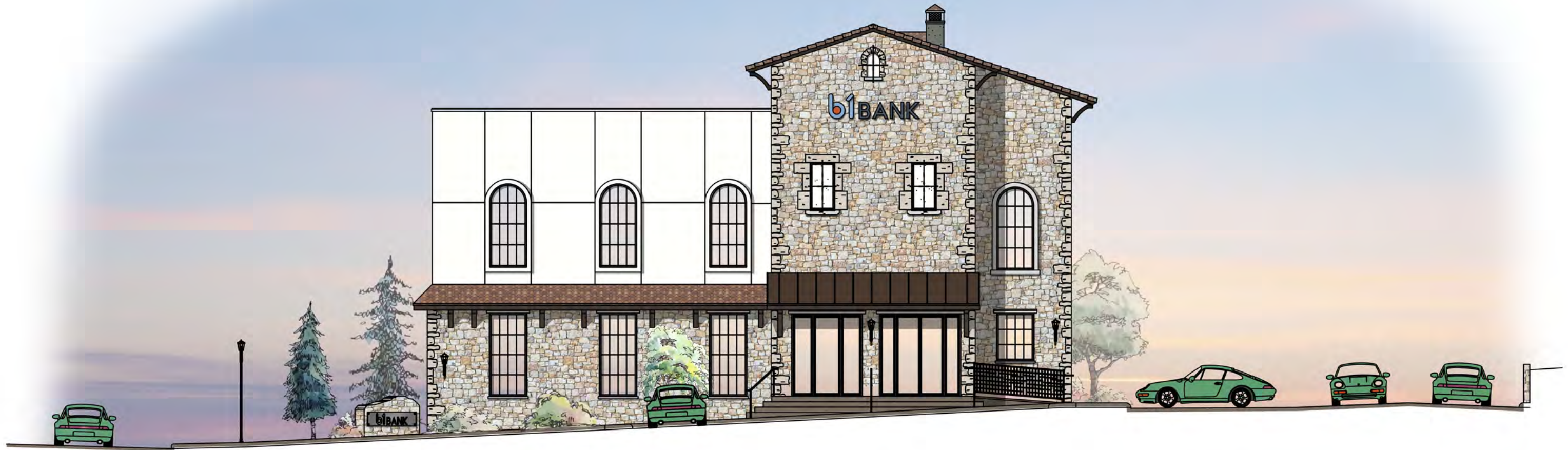
1 FRONT ELEVATION – NORTH – ANDORRA DRIVE SCALE: 3/32" = 1'-0"

REFER TO ENTRADA DESIGN GUIDELINES (ORDINANCE 760) FOR DETAILED DESIGN INFORMATION