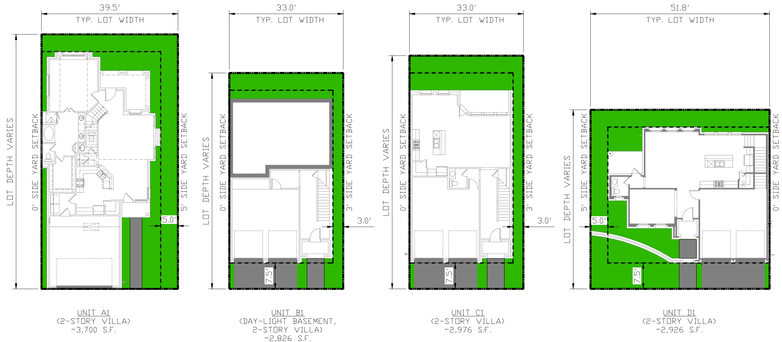
1 TYPICAL LOT LAYOUT SCALE: 1/16" = 1'-0"

REFER TO ENTRADA DESIGN GUIDELINES (ORDINANCE 760) FOR DETAILED DESIGN INFORMATION