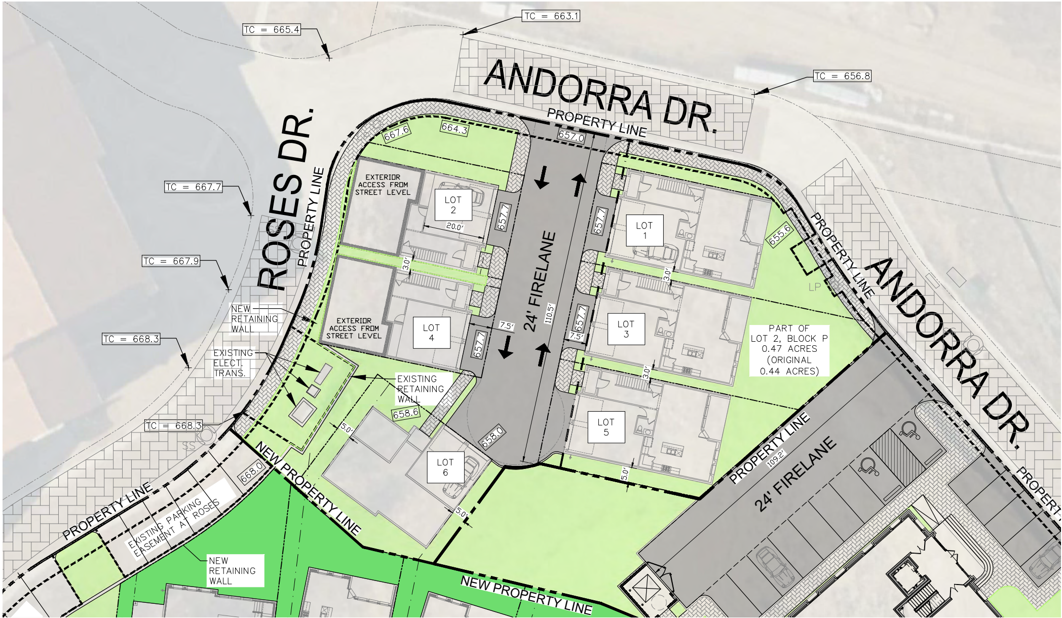
1 ARCHITECTURAL SITE PLAN – PART OF LOT 2, BLOCK P – RESIDENTIAL SCALE: 1/32" = 1'-0" 0.53 ACRES (PREVIOUSLY 0.44 ACRES)