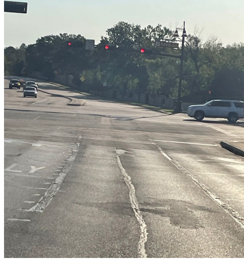
Dove Road at Davis Blvd.