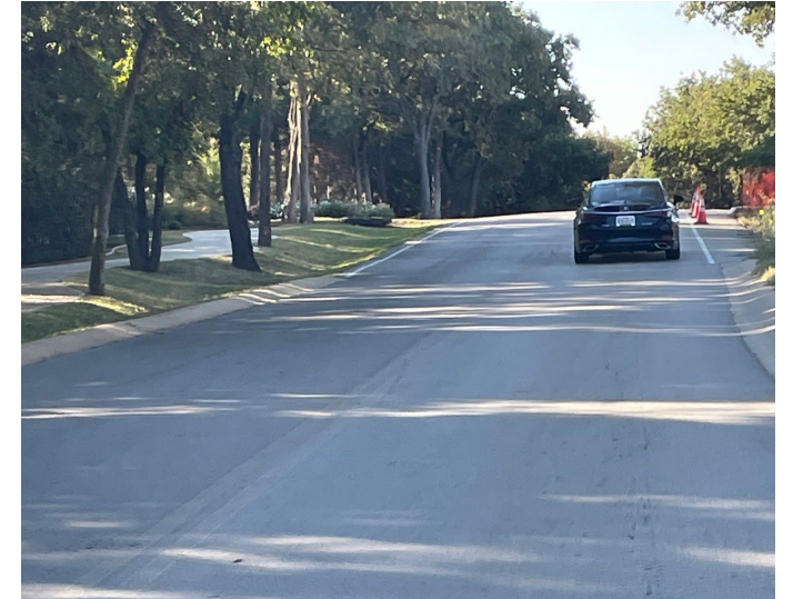
North Pearson Lane