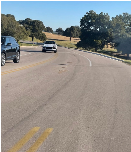
J.T. Ottinger Road