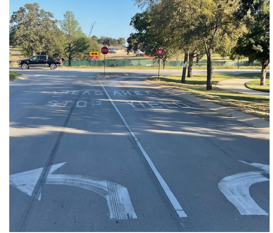
North Pearson Lane at Dove Road